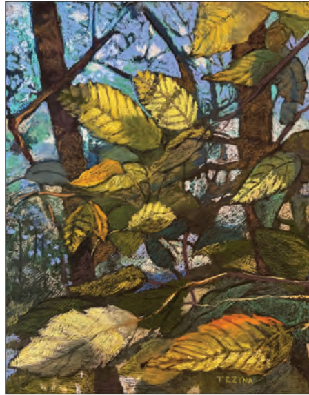
Walking in Sunlit Woods MEDIUM: pastel IMAGE: 11in x 14in