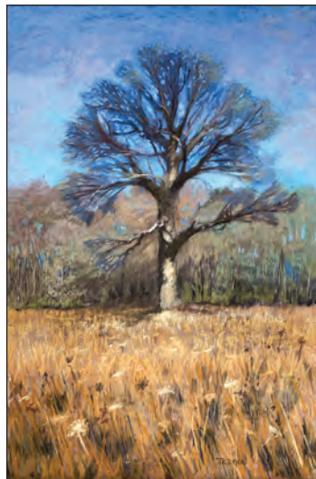
Afternoon Light, Tree