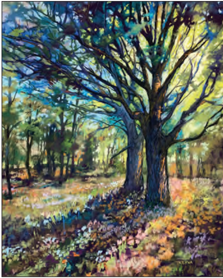
Oak Tree in October Sun