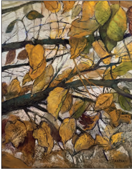
Looking Up MEDIUM: pastel IMAGE: 11in x 14in