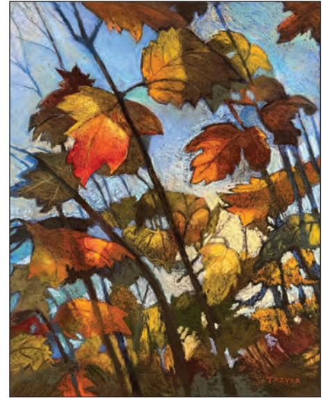
Sunlight and Leaves MEDIUM: pastel IMAGE: 11in x 14in