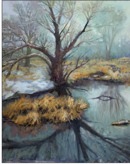
Winter Fog, Wetlands