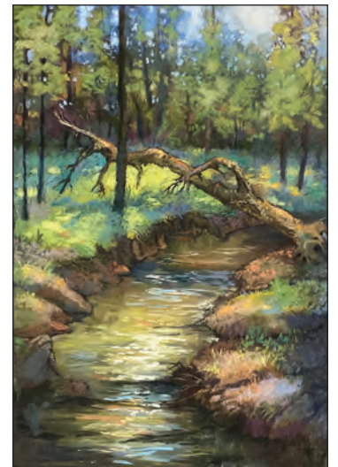
Off the Paved Path